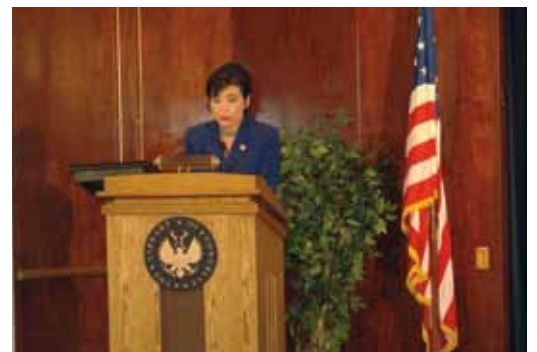
CONGRESSWOMAN JUDY CHU AT THE LIBRARY OF CONGRESS DURING THE SECOND DAY OF THE INTERNATIONAL CONFERENCE.