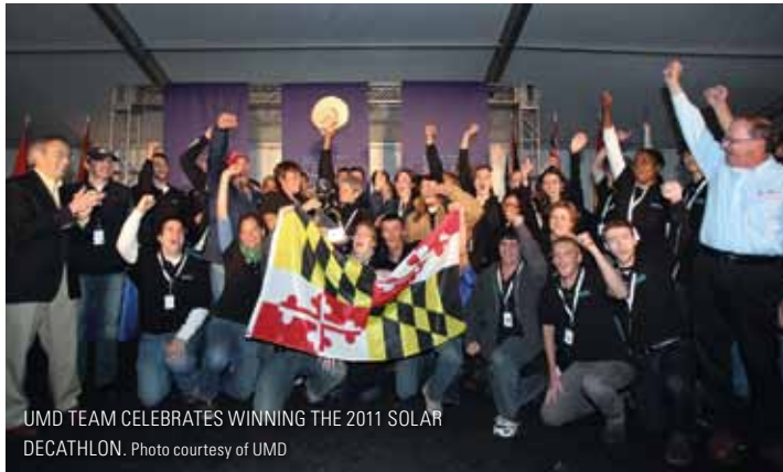
UMD TEAM CELEBRATES WINNING THE 2011 SOLAR DECATHLON.

The Maryland Solar Decathlon Team involves students and faculty from the Maryland School of Architecture, Planning and Preservation, the A. James Clark School of Engineering, the College of Computer, Mathematical, and Natural Sciences, the University Libraries, and the School of Agriculture and Natural Resources. Maryland businesses and professional groups provided significant support as well.