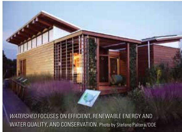
WATERSHED FOCUSES ON EFFICIENT, RENEWABLE ENERGY AND WATER QUALITY, AND CONSERVATION.

“The DOE 2011 Solar Decathlon Competition epitomizes a worldwide focus on energy and sustainability. With teams participating from New Zealand, China, Belgium, and Canada, the solar decathlon achieves its goal of getting the international community engaged to reduce our worldwide energy footprint through the design and construction of sustainable homes. Winning the competition is a true testament to the